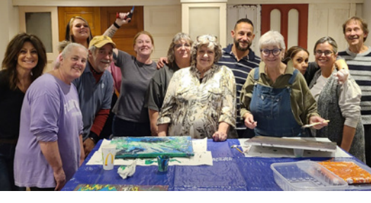
We are so grateful for the 36 volunteers who provided 2,255 hours of service at our Healing Springs Recovery Center in 2023.