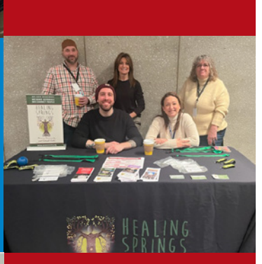
3,500 STUDENTS ACROSS 14 SCHOOL DISTRICTS received mental health support services during the school year.

OVER 225 students received mental health support services during the school year.