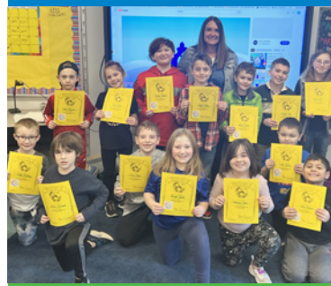
500+ YOUTH FROM 9 ELEMENTARY SCHOOLS participated in our "Be A Hero, Respect Others" poster contest.