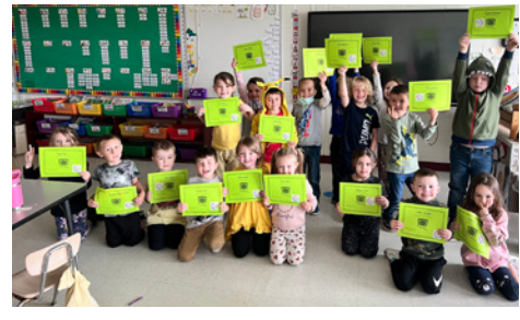
"I learn something new every year from this program. I wish my own children had been able to have the TGFD program when they were in 5th grade." - 5th grade teacher Ballston Spa (Too Good For Drugs)