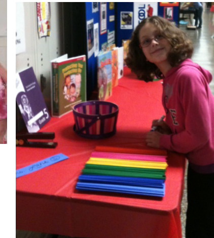
At left: Super Star with faculty and students of Waterford-Halfmoon. Below: Schuylerville elementary student learns how she can stop bullying.

This message, as well as other prevention education regarding gambling was made possible by a grant from NY Center for Problem Gambling . In 2014 we reached over a 1000 people through direct education, billboards, and social media.