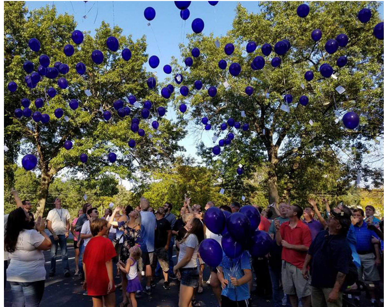
(On the cover) Together We Rise! Recovery Celebration with Healing Springs Recovery & Outreach Center