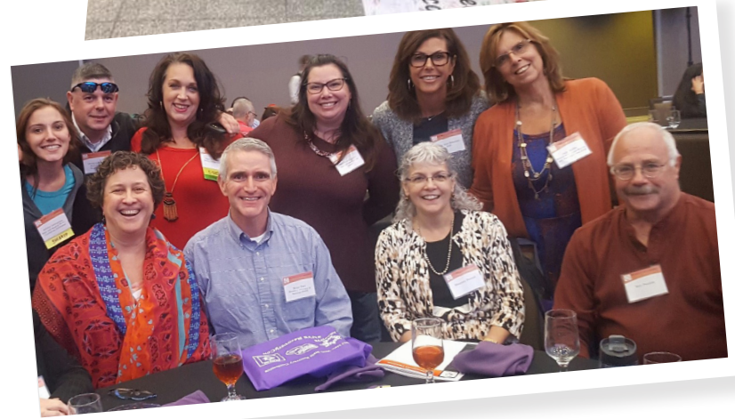
(Top to bottom) Panelists at Opioid Forum at Burnt Hill-Ballston Lake High School; SADD students marching in South Glens Falls Holiday Parade with Super Parenting banner; Saratoga Springs SADD Chapter students signing banner during Red Ribbon Week; Recovery Advocates and staff at the Annual NYS Recovery Conference.